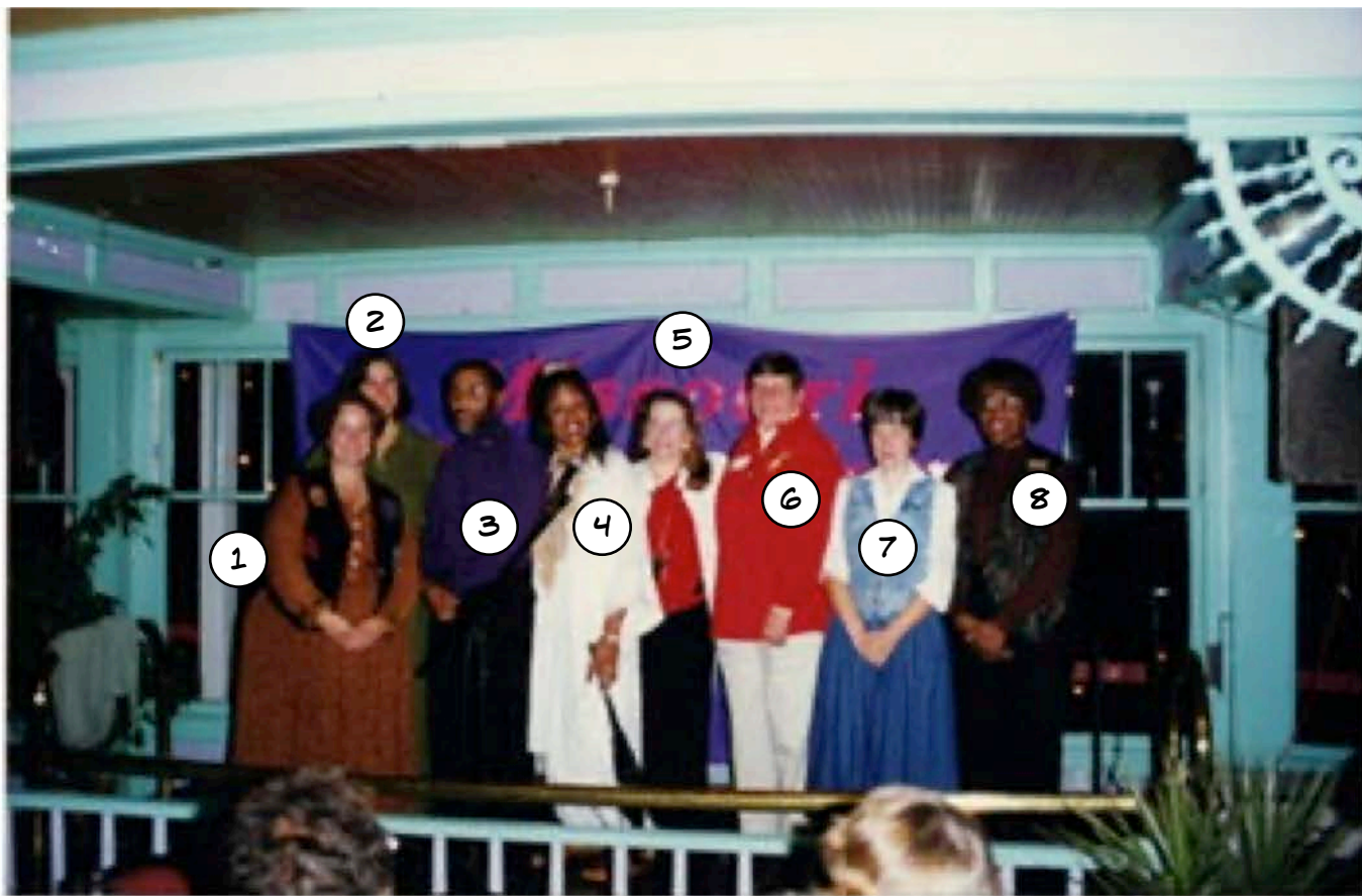
MOTELL picture from 1997, October storytelling festival on the Goldenrod